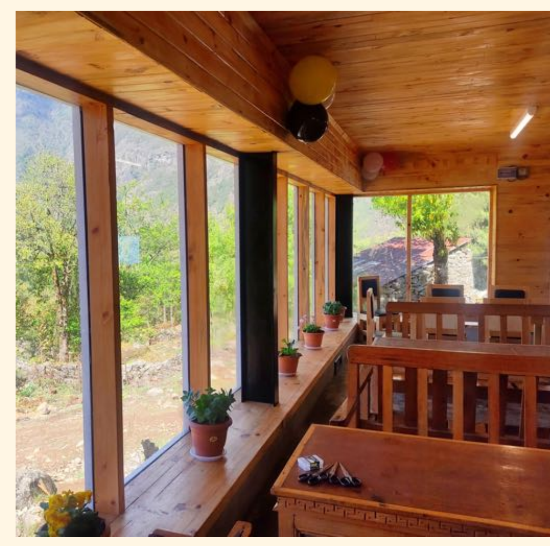
New Dinning hall

It was very important to build a new kitchen dining hall for the students and teachers living in the Chaurikharka school.