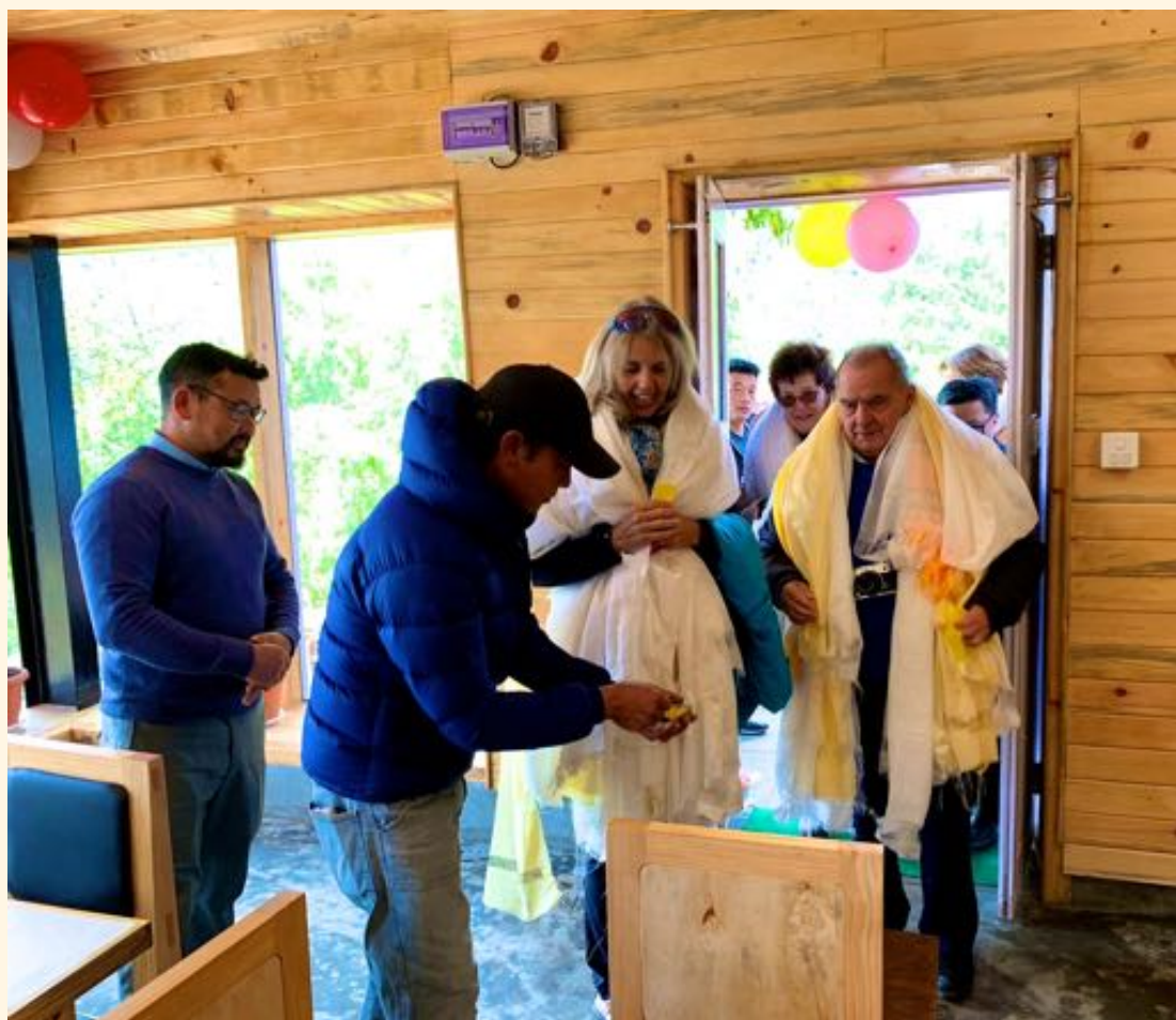
Opening celebration of the kitchen dining hall