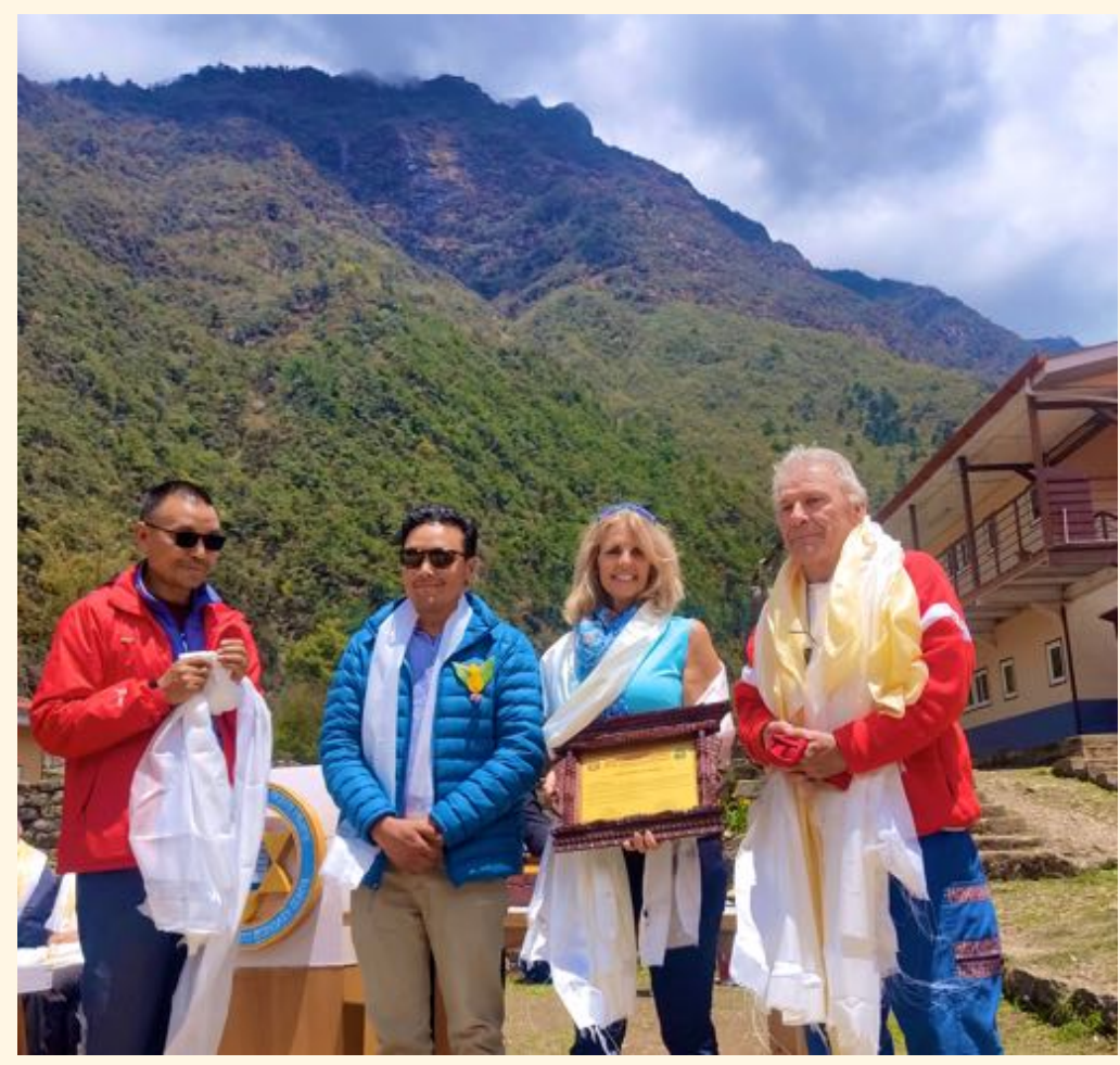
The president and Vice President of Luklass Association receiving the appreciation letter from local government