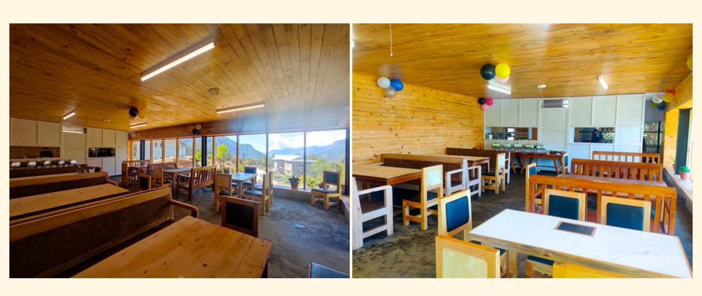
New Dining hall